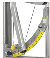
Bar handle height adjustment